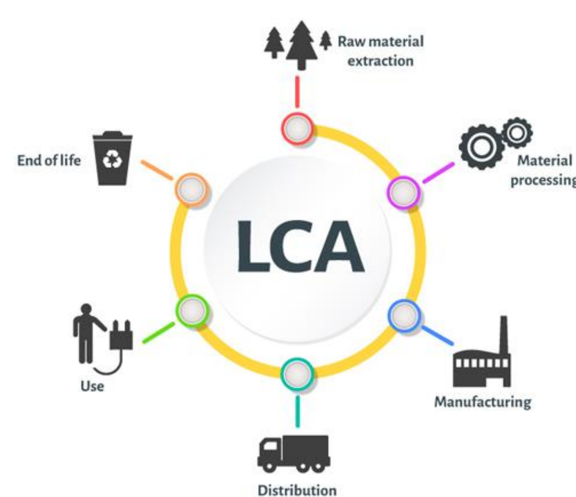
Figure 1. LCA General Flow

LCA investigates the potential environmental impact by evaluating input and output materials and processes for a single or multiple products, processes and services. LCA is achieved by covering the extraction and processing of the raw materials, the manufacturing process, transportation and distribution, product usage, and finally recycling and disposal, though the life time of a product. The General LCA flow can be seen in Figure 1. The environmental LCA principles and frameworks, and, requirements and guidelines, are described by ISO 14040 (2006) and ISO 14044 (2006) respectively.